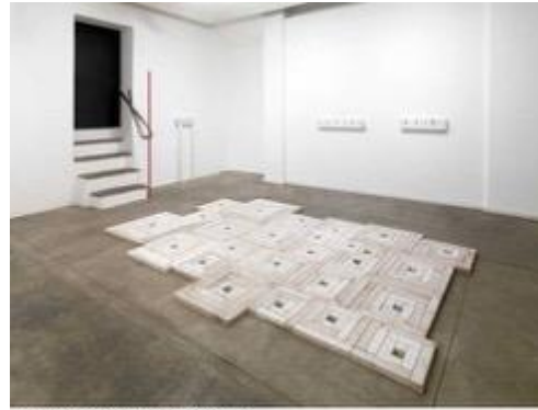
Installazione di Paolo Icaro alla galleria G7